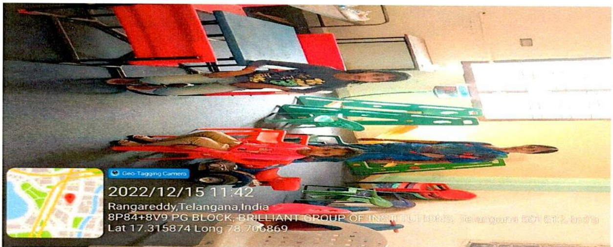
Baby care center at BRIL to take care of Faculty children

The newly married employee, who has young child unable to continue their job due to caring person not available at home, BRIL provides day care centre for employee young children's and provides toys and games under supervision of a care taker and attender.