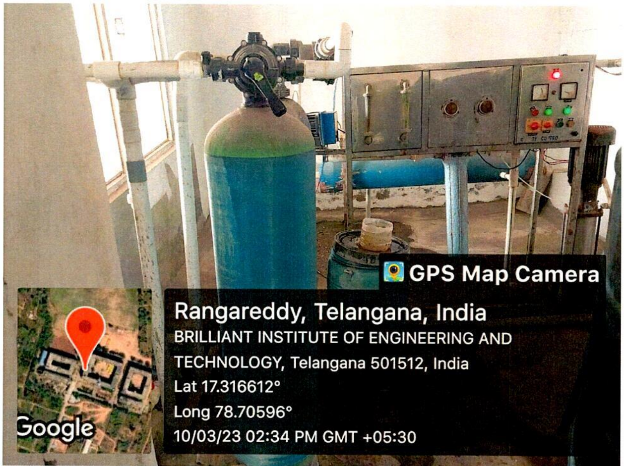
Water Purifier at BRIL

Website: www.b-iet.ac.in , e-mail: principal@b-iet.ac.in Contact No.: +919652929786